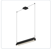
LP73536-BK/WH- UNV Black/White